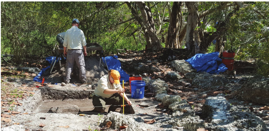
Archaeologists from various organizations look for answers at the park's tabby house.

From May 23-28, archaeologists from the Southeast Archaeological Center (SEAC), Florida Public Archaeology Network (FPAN), New College and the University of South Florida conducted an archaeological investigation of the tabby house ruins at the park.