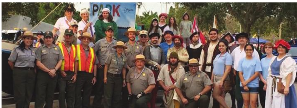
De Soto National Memorial staff, volunteers and Friends members gave the park a strong presence at the annual grand parade.

The park is in Bradenton, minutes from downtown and nearby to Sarasota, St. Petersburg and Tampa. The National Memorial invites the public to find their park and discover national parks and programs, literally in their own back yard.