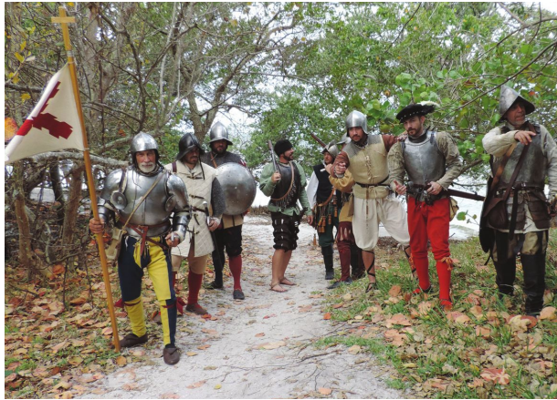
Hernando de Soto and his men move inland after landing.

Both landing events drew great crowds and were covered by local news media. Park leaders send a special thanks to the "excellent staff and volunteers."