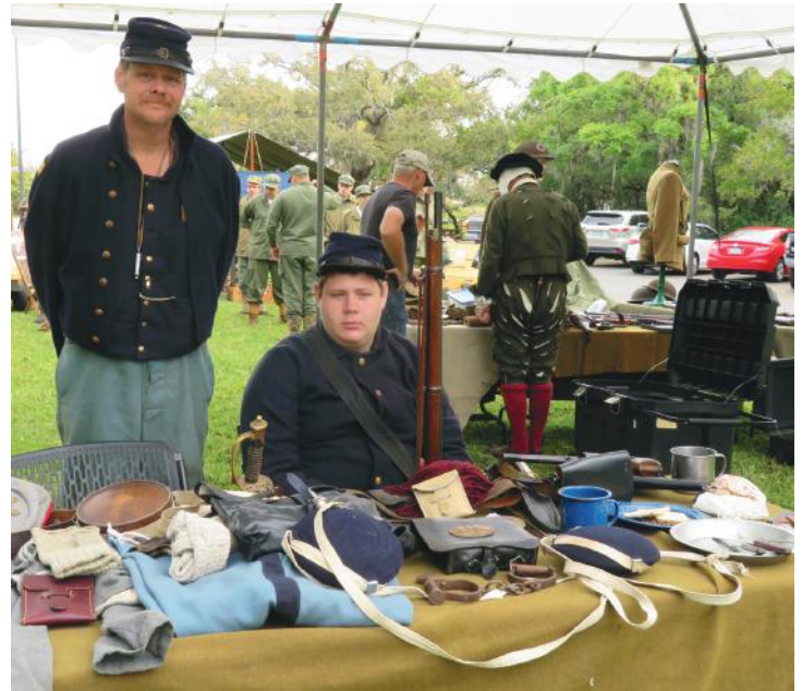
Re-enactors help bring Florida history to life during the annual Five Centuries event at the park.