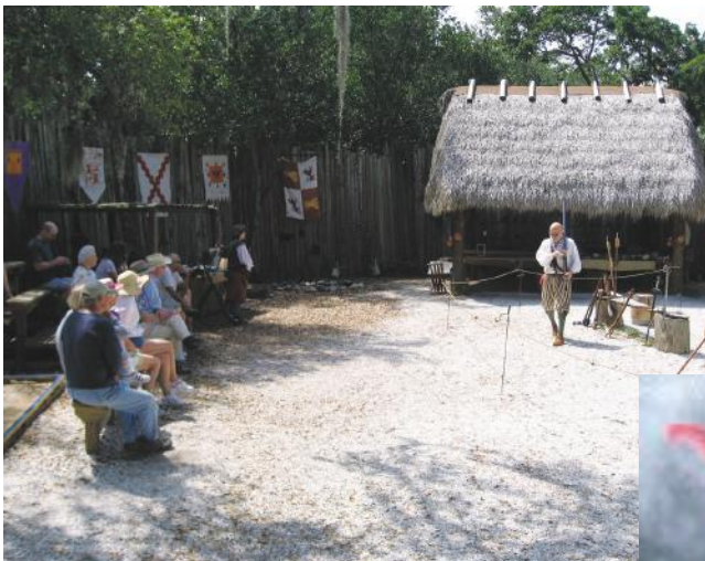
De Soto rangers and volunteers wear period clothing during their talks and demonstrations in Camp Uzita. The camp program brings history to life for park visitors.

De Soto National Memorial visitors will get a unique look into Spanish and American Indian life in the 16th Century at Camp Uzita.